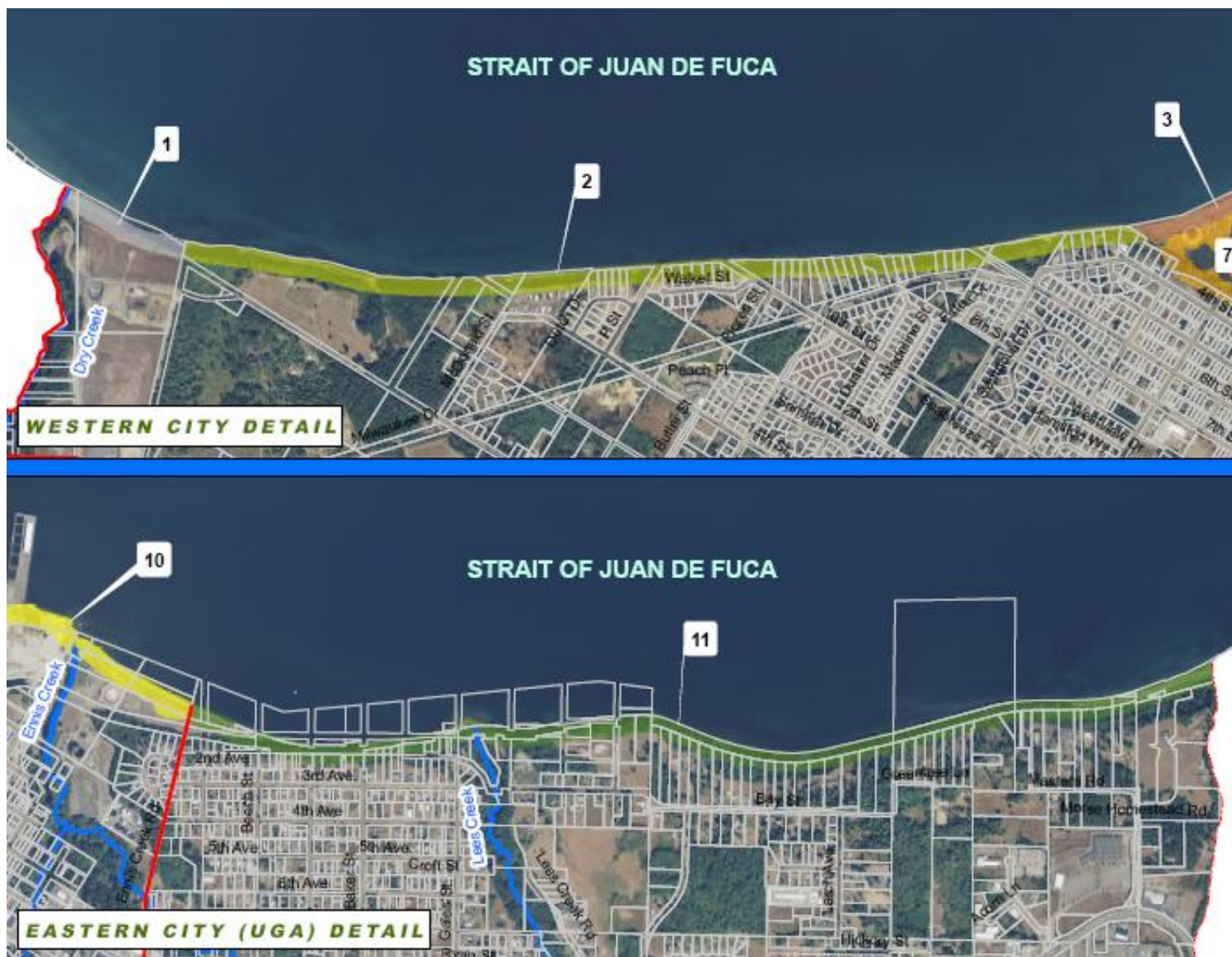
Figure 2b. Map of shoreline reaches for the Western City and Eastern City UGA