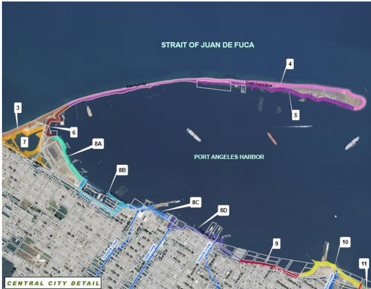
Figure 2a. Shoreline reaches in the Central City portion of the City of Port Angeles.