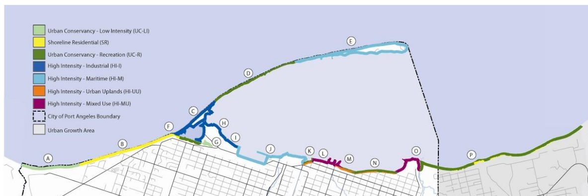
Figure 3. Environment designations for the City of Port Angeles

The first line of protection of the City's shorelines is the environment designation assignments (see Figure 3).