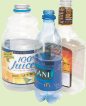
Plastic bottles (necks smaller than base)