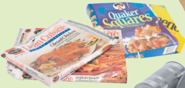
Paper food boxes