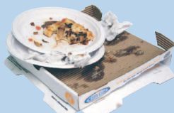
Food-contaminated paper plates, napkins, and pizza boxes