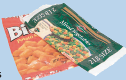
Frozen food bags