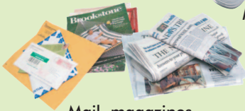
Mail, magazines, mixed paper, catalogs, newspapers and inserts