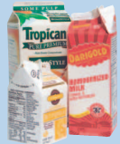
Paper milk-style cartons