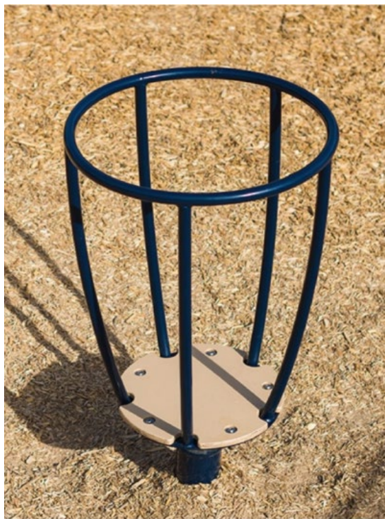
Figure 5: Spinners provide an opportunity to stimulate the vestibular system - important for development.