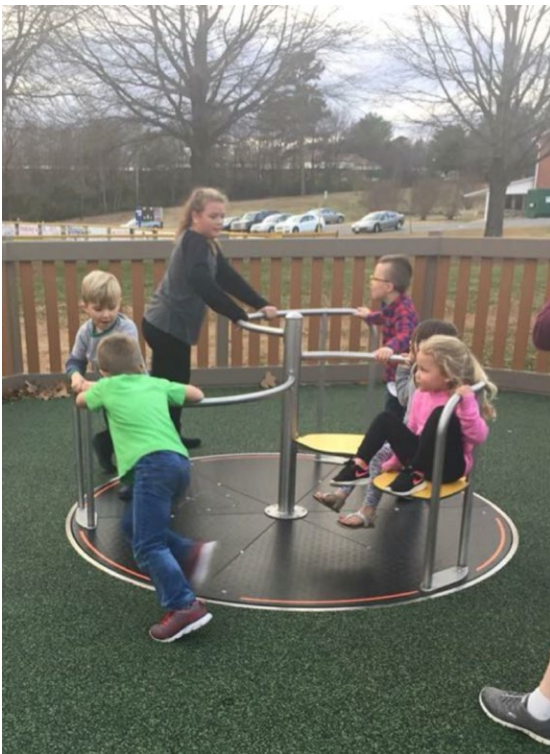
Figure 4: Inclusive Orbit (Merry-Go-Round) has a revolving deck which is flush with the surrounding surface, enabling wheelchair users direct access to the equipment.