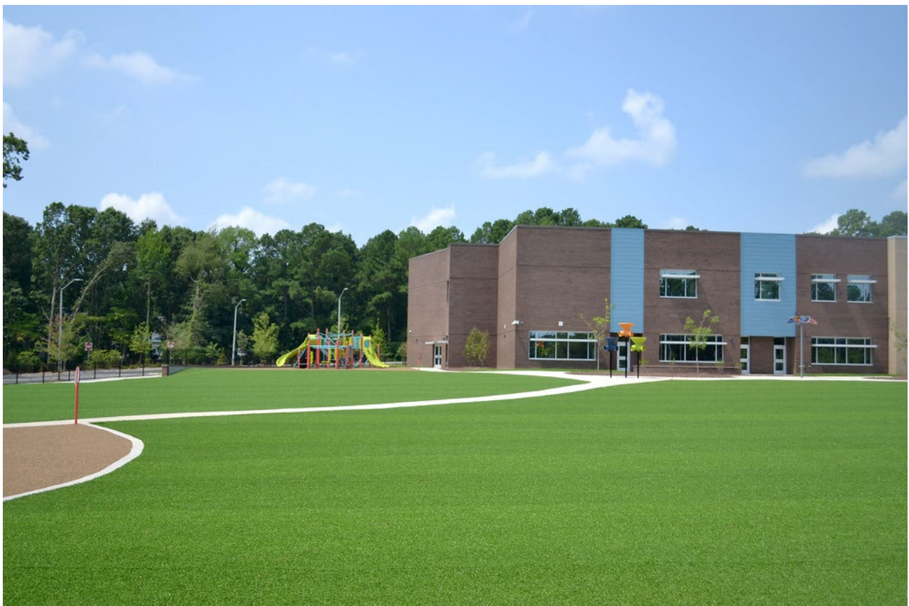
Figure 2: Foreverlawn Playground Grass. (n.d.). Playground Grass. https://www.playgroundgrass.com/play-stories/photo-gallery/ .