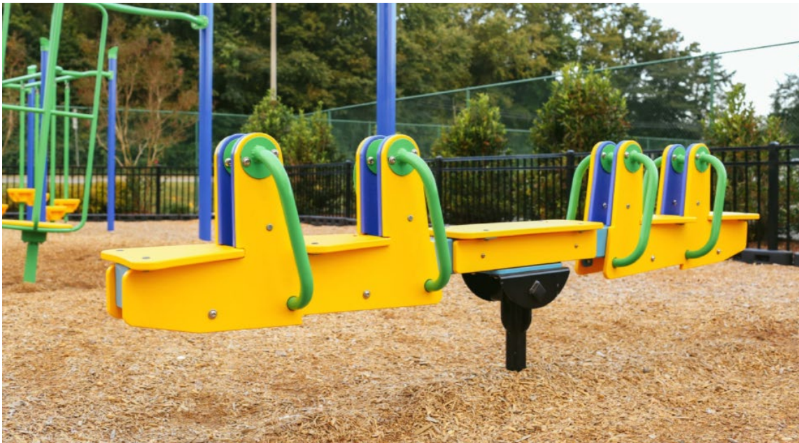
Figure 3: 4-person See-Saw allows multiple children to play at once. This element stimulates the vestibular system, which is important for development.