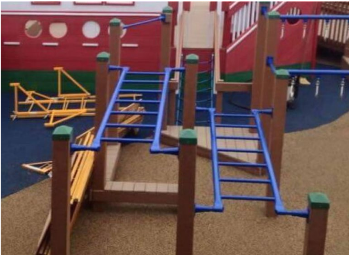
Figure 7: High/Low (ADA) Monkey Bars allow children of differing abilities to play side by side.