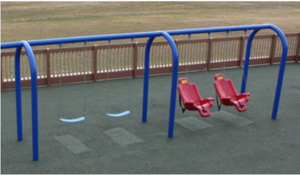
Figure 6: Inclusive swing seat can be used by children of all abilities.