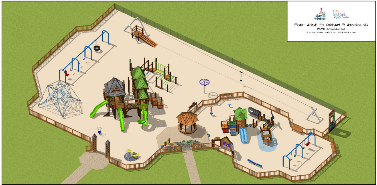
Figure 1: Port Angeles Dream Playground Design