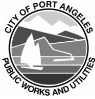
EXHIBIT D DEVELOPER REIMBURSEMENT AGREEMENT, DRA #XX-XX [description] [date]