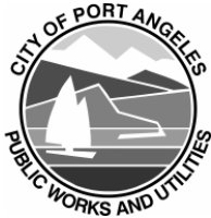
EXHIBIT A Preliminary _____ Final _____